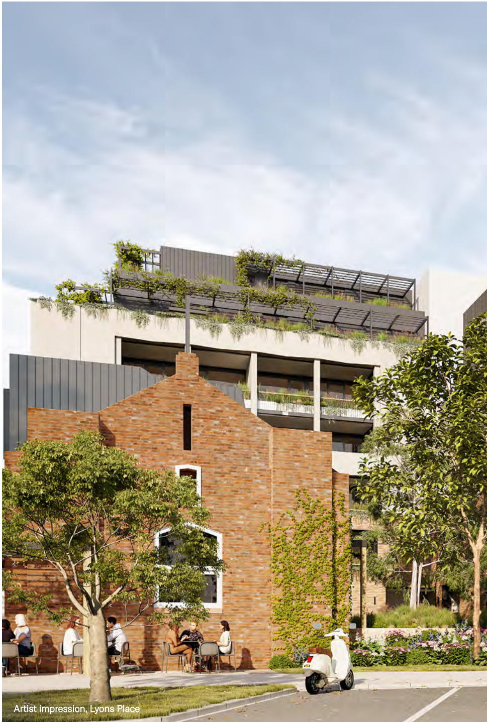
Artist Impression, Lyons Place

While still retaining the old-world charisma of its gold rush past, Ballarat is now a modern city with a trendy creative undercurrent and a rich community spirit. Friendly locals offer wares and services to rival a capital city selection, but with a familiar, small-town feel. It is little wonder Ballarat is becoming one of regional Victoria's most coveted places to live.