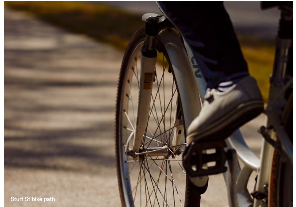
Sturt St bike path