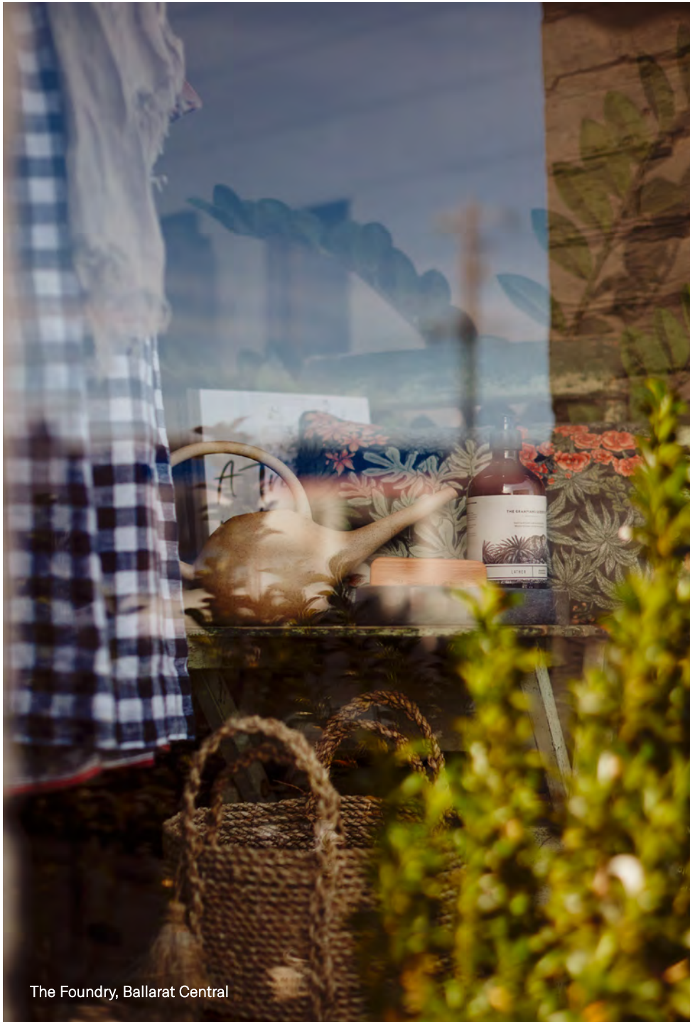
The Foundry, Ballarat Central